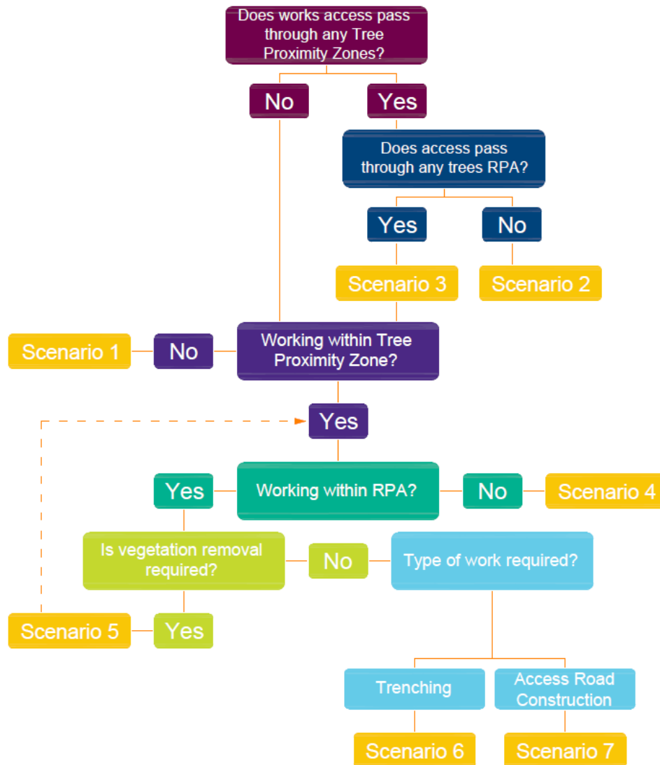
Figure 1.2: Tree protection scenario flow chart.